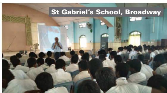
St Gabriel's School, Broadway