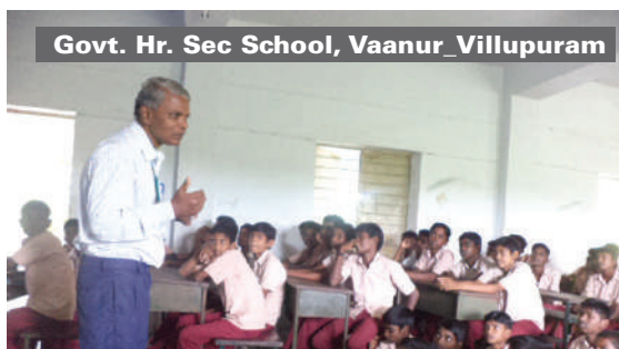
Govt. Hr. Sec School, Vaanur Villupuram