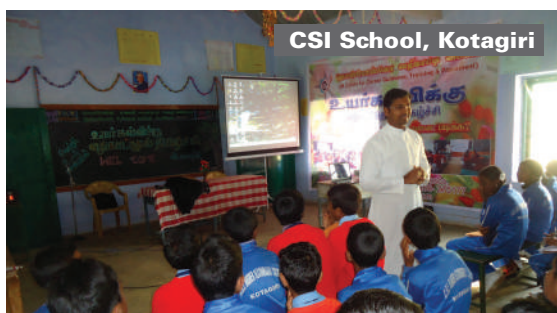
CSI School, Kotagiri