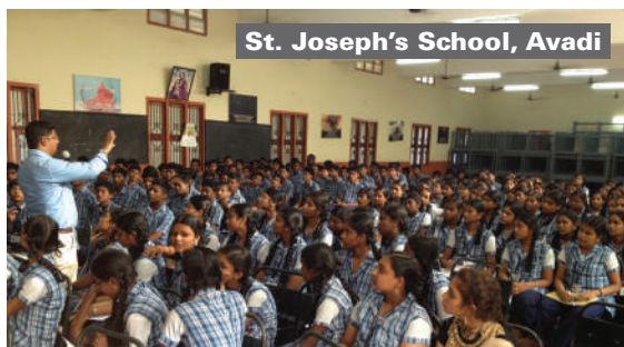
St. Joseph's School, Avadi