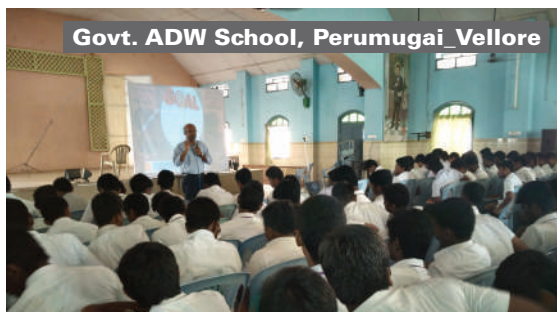
Govt. ADW School, Perumugai Vellore