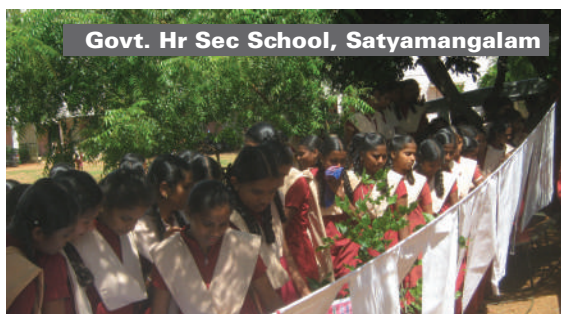
Govt. Hr Sec School, Satyamangalam